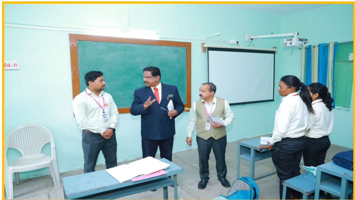
1.8 M.P.Ed. II